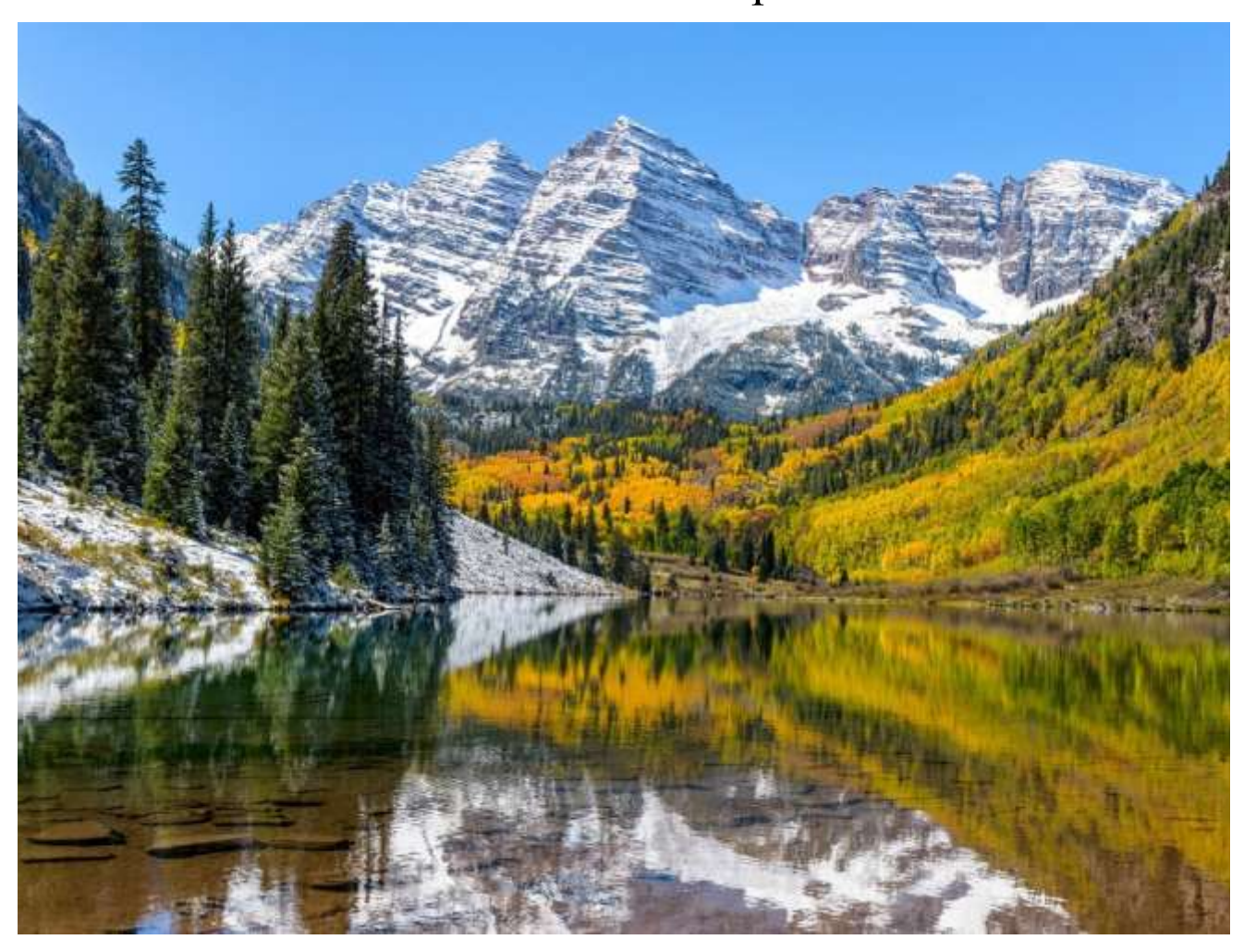
Driving the Byway

You'll start your journey at the eastern boundary of Rocky Mountain National Park in Estes Park. After exploring Estes Park, the next morning you'll have the pleasure of driving Rocky Mountain National Park's highway to the sky, Trail Ridge Road National Scenic Byway, before you reach the Colorado River Headwaters Scenic Byway. Bring a picnic lunch with you, since only the Alpine Visitor Center has snacks and there are no restaurants on Trail Ridge Road. Plan to take your time as you cross the park, and even spend most of the day. When Trail Ridge Road ends it flows right into the Colorado River Headwaters Scenic Byway at Grand Lake. After an overnight in Grand Lake, spend Day Three driving the Colorado River Headwaters Scenic Byway, exploring small historic towns of Granby, Hot Sulphur Springs, Kremmling and State Bridge, along with the museums in each of the towns to explore local heritage.