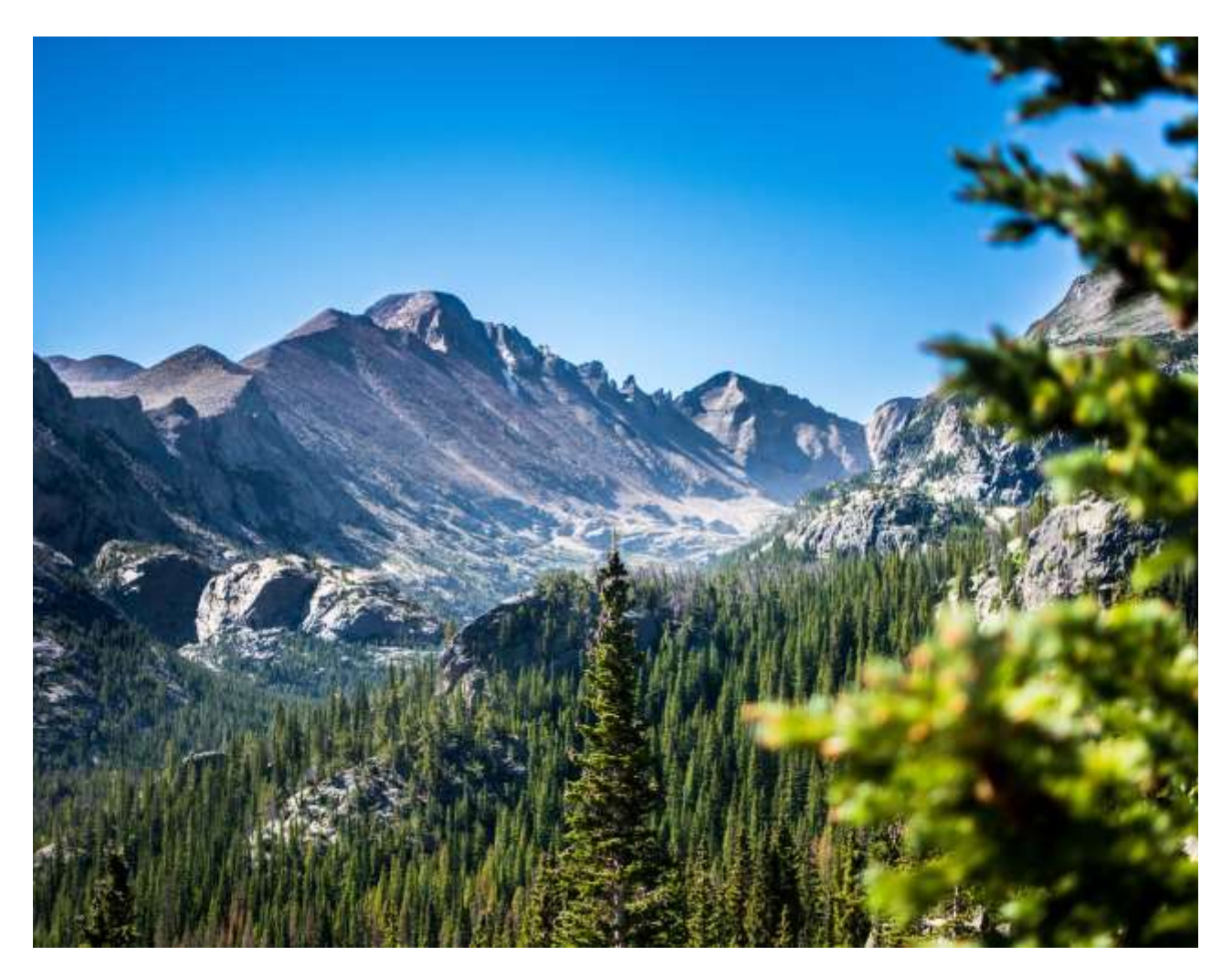
Rocky Mountain National Park

With more than 60 peaks rising over 12,000 feet, Rocky Mountain National Park is a true Rocky Mountain high. A dozen magnificent alpine lakes feed the headwaters of the Colorado River – the same river that cut the Grand Canyon! Countless breathtaking vistas range from 8,000 to 14,259 feet with a third of the park above the tree line. Scenic vistas and well-placed overlooks allow you to take in the Park's awe-inspiring landscapes at your leisure. Take a five-minute stroll for a magnificent view of Forest Canyon, Hayden Gorge and Gorge Lakes at Forest Canyon Overlook. Stand on the Rock of the Rockies at Rock Cut and Rainbow Curb, elevated more than two miles above sea level. At Milner Pass, the Trail Ridge Road meets the Continental Divide National Scenic Trail. Take your time and savor the views.