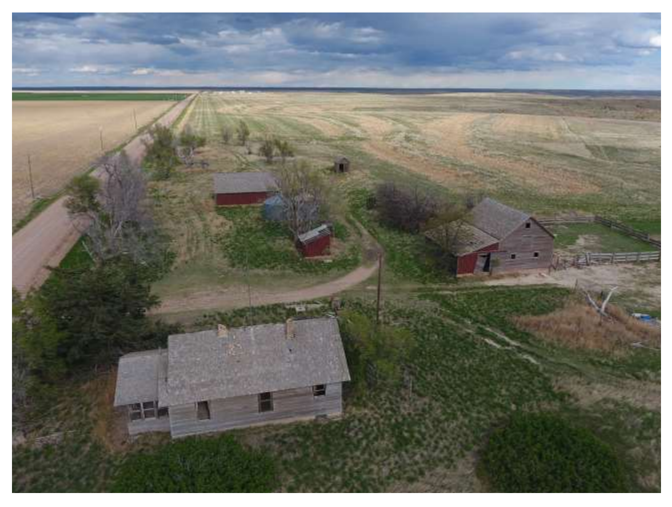
Driving the Byway

Your journey begins in Greeley, the center of agriculture and farming in northeast Colorado. From there, you'll travel up to Ault, the beginning of the Byway and the gateway to the Pawnee National Grasslands. From there, it's on to Briggsdale and to Grover, where the Grover Depot Museum introduces you to early life in the region. Just beyond Grover, you'll see the Pawnee Buttes. Then drop down to Fort Morgan, for an overnight stay. Back up at New Raymer, you'll be on your way to Sterling and then to Julesburg and the South Platte River Trail. Unlike many of Colorado's Byways in the mountains, the roads here are straight and the drive goes fast.