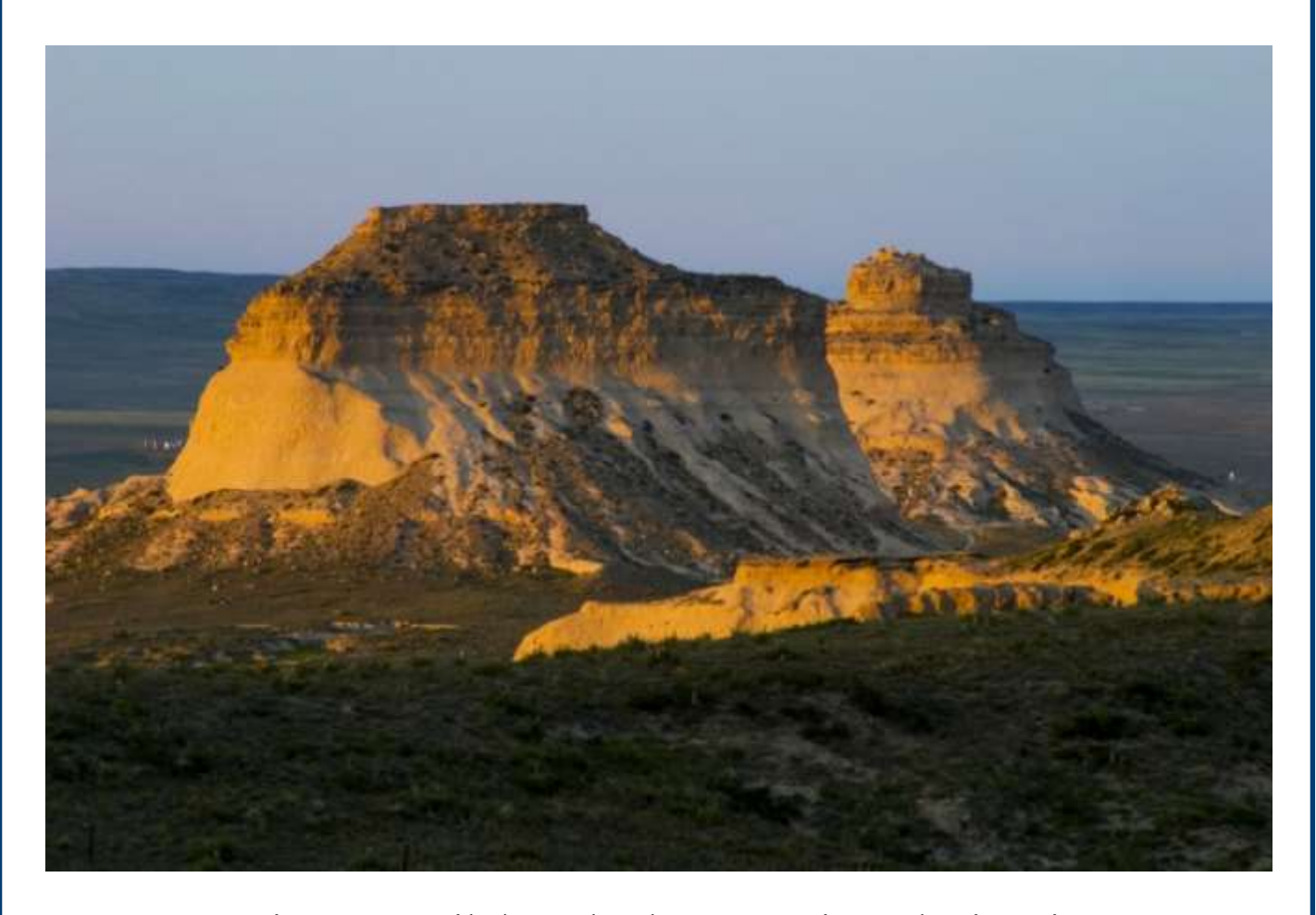
Pawnee Pioneer Trails/South Platte Scenic and Historic Byways

This, in the massive tallgrass prairie, to quote the song, is where the deer and the antelope play. No trees grow here, because it's in the rain shadow of the Rocky Mountains. All the rain is wrung out when the clouds pass over the mountains. The Pawnee Pioneer Trails Scenic and Historic Byway traces the steps of Native American and pioneer trails across the open grassland plains of Northwest Colorado. Once sprinkled with Plains Indians and buffalo, frontiersmen, ranchers and homesteaders settled in the 19<sup>th</sup> century. Life here was hard, It still mostly is, challenged every day by isolation, droughts, high winds and blazing sun. Railroad towns grew up, but few flourished. The Pawnee Buttes, two 350-foot sandstone wonders that author James Michener called "the sentinels of the plains" stand proudly looming over it all. In spite of the harsh conditions, the wind-swept region is known internationally for birding. The lark bunting, the Colorado State Bird, is common in the spring and summer. Other species include the long-billed curlew, mountain plover and burrowing owls. As you drive, watch for pronghorn, mule deer, coyote, swift fox, snakes and prairie dogs. At the end of your Pawnee Pioneer Trail Byway, we've extended the trip with a drive on the South Platte River Trail, the shortest Byway in Colorado.