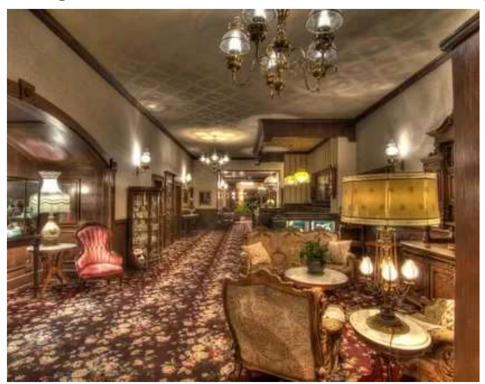
Durango Destination Distinctive Accommodations and Dining

Destination Distinctive Accommodations: General Palmer Hotel 567 Main Avenue, Durango, CO 81301 970-247-4747