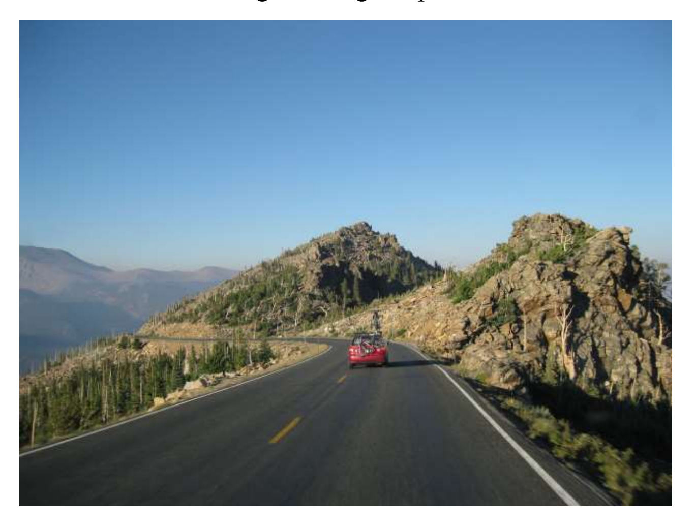
Driving the Byway

You'll begin your journey in Estes Park at the east edge of Rocky Mountain National Park. After spending a day exploring there, you'll have a full day to explore the Park, ending the day in Grand Lake, where there are accommodations and dining options.