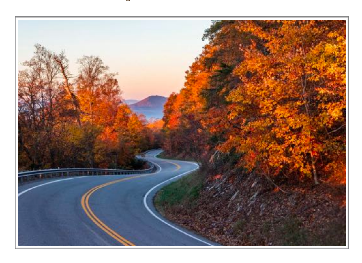
4 Days/3 Nights Gateway City: Charlottesville, Virginia