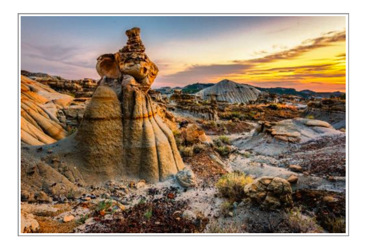
3 Days/2 Nights Gateway City: Glasgow, Montana