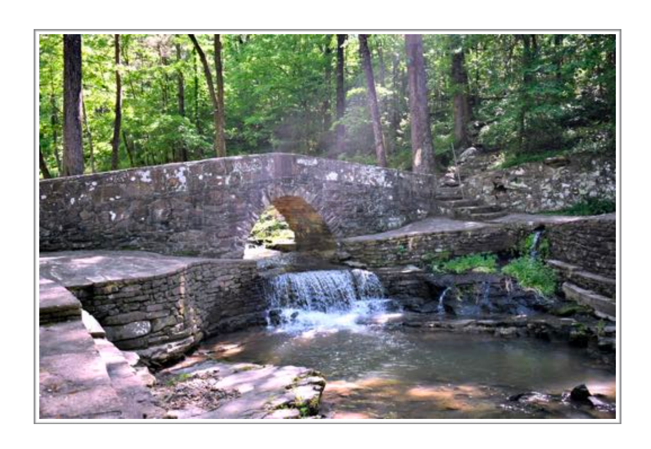
4 Days/3 Nights Gateway City: Little Rock, Arkansas