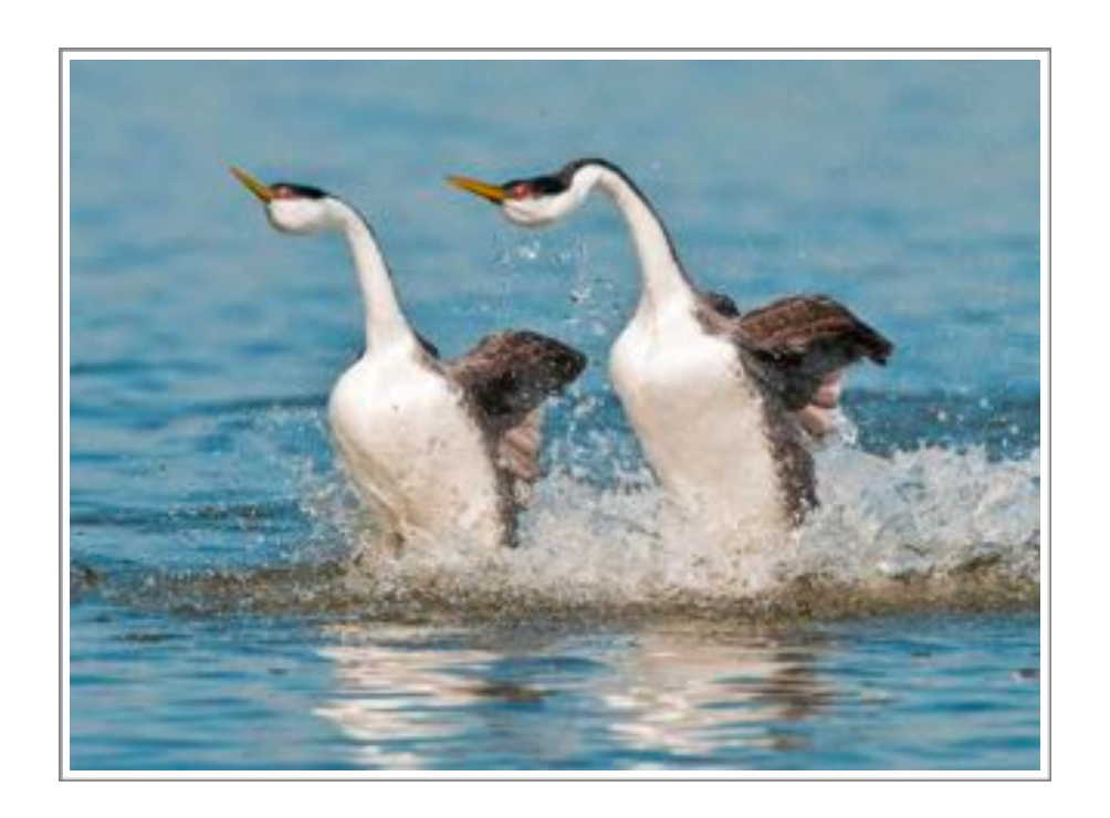
The 7 ½-mile Canada Goose Nature Trail adjacent to the southern end of Upper Des Lacs Lake is great for viewing migrating and breeding waterfowl. Tasker's Coulee is a unique wooded area consisting of a Day Use Area with mowed grass nature trails and wildlife observation. A historic Civilian Conservation Corps shelter with tables and a bathroom is located near the parking area. Munch's Coulee is a 1¼-mile designated Nature Trail National Recreation Trail. The first ¼-mile of the trail is level, hard-surfaced, and wheelchair accessible. The next 1-mile trail segment is mowed grass with some steep slopes but delivers breathtaking

Des Lac National Wildlife Refuge Scenic Byway consists of a North and South auto tour divided by the town of Kenmare. Sixth Street in the center of Kenmare takes you to the Refuge Visitor Center, with a large sign at the intersection of County Roads 1 and 1A. The 11-mile South Drive follows the shore of Middle Des Lakes Lake. The road is gravel but well-maintained and not well-traveled. On the drive you may see white pelicans, several species of Grebes, several species of ducks, glossy ibis, cormorants, coots, red-tailed hawks, deer, orioles, American avocets, and black crown night herons, among other birds. The 5-mile North Drive is also a two-way well-maintained gravel road that is very narrow in some places. There is a picnic area and bathroom near the end.