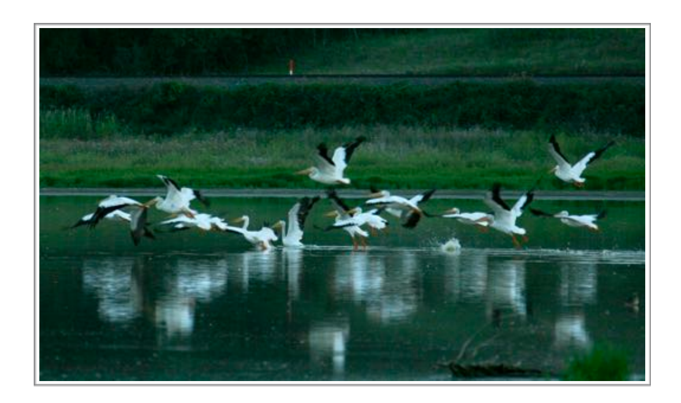
"A dark line of trees marked our approach to a running stream, the River of Lakes .... The conical skin lodges were now plainly in sight, not more than five miles off, and Indians galloped out from the camp to meet us and escort us in. Buffalos, they said, were plenty."