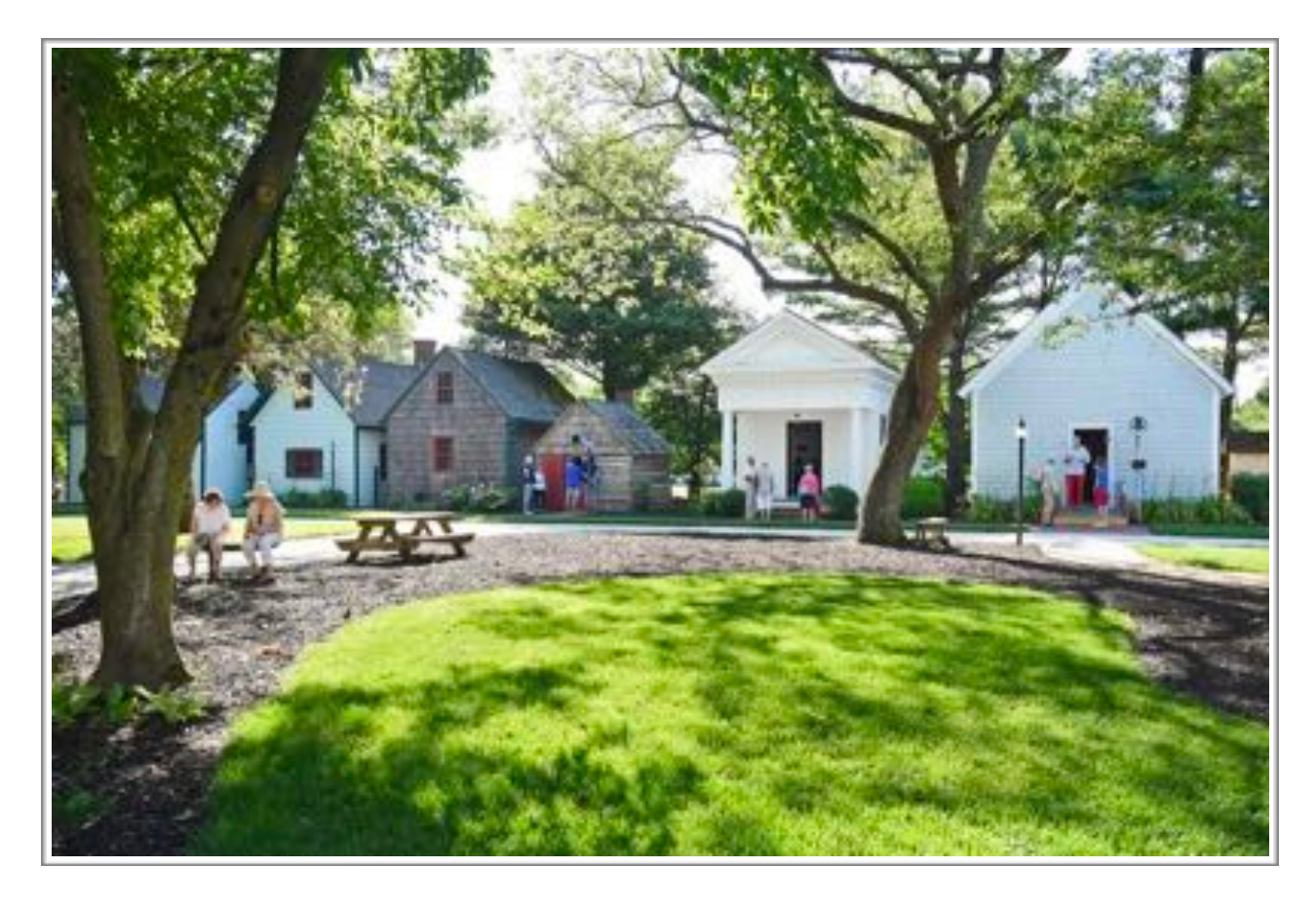
Building, Zwaanendael Museum, Cornelius Burton House, Lewes Historical Society enclave, and the De Wolf Houses.

110 Shipcenter Street, Lewes, DE 19958, 302-645-7670, Architectural Walking Tour, Th and Sun, 5PM, Adults $10